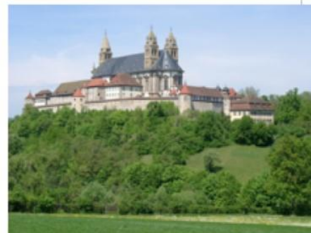
Schwäbisch Hall Comburg